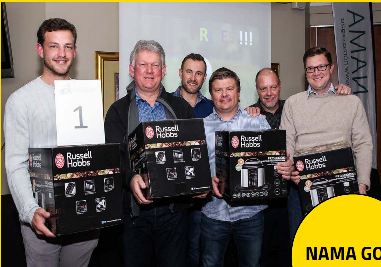
NAMA GOLF DAY