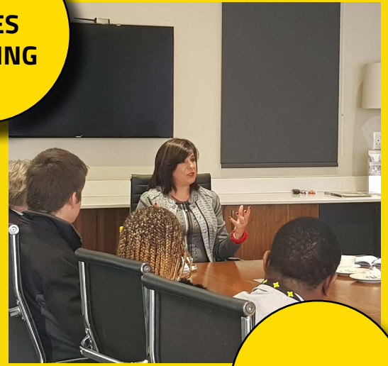
WELCOME TO THE CLOUD